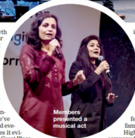
Members presented a musical act

He further elaborated, "As a part of CSR initiative, every weekend, volunteers invest their efforts in engag-