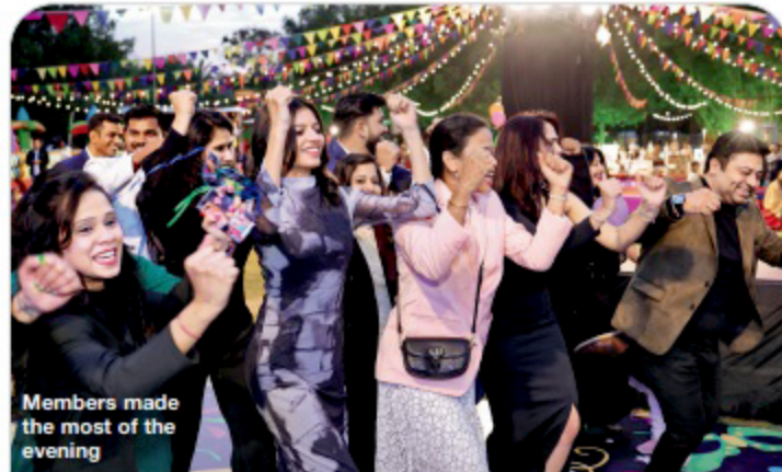
Members made the most of the evening