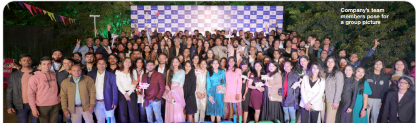
Company's team members pose for a group picture